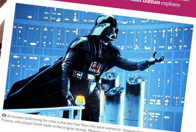
Bristolians auditioning for roles in the new Star Wars film were warned to "disguise their accents" by David Prowse, who played Darth Vader in the original movies.